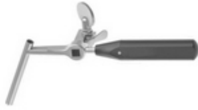
88-101 Caspar Drill Guide Right Standard