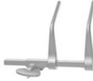
88-102 Caspar Vertebral Distractor Left Standard