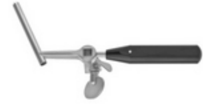
88-103 Caspar Drill Guide Left Standard