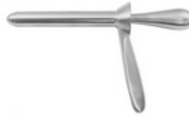
103-123 Kelly Proctoscope Fig. 4 Diameter - Working Length 22 mm Ø - 200 mm