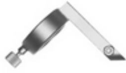
103-119 Head End Only